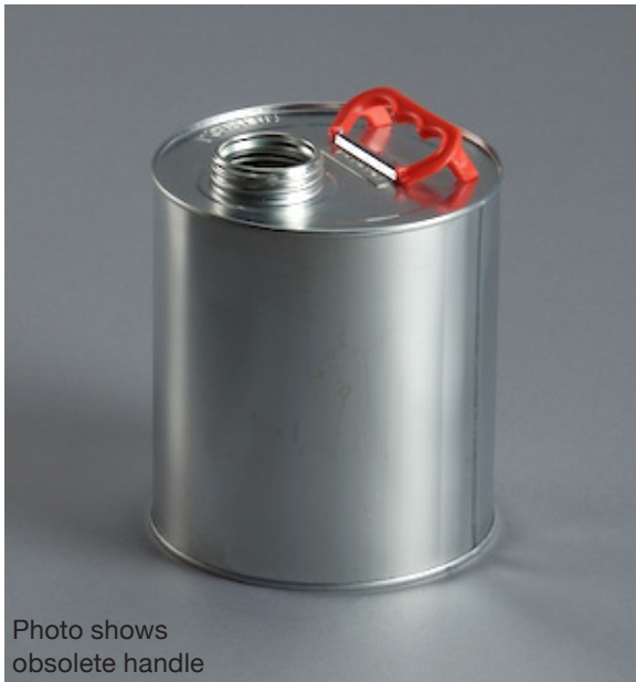
Photo shows obsolete handle